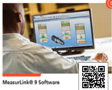
MeasurLink® 9 Software

Allowing online monitoring of the operational status of measuring machine and visualization of measurement data produced during the manufacturing process to enable product quality improvement.